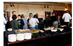
Dinner at the Zoo