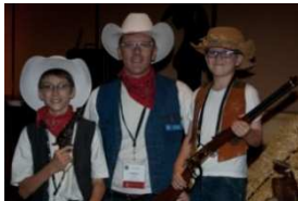
The Happer Gang