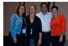
Quebec Convention presentation team