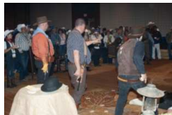
Shootout at the Hyatt Corral