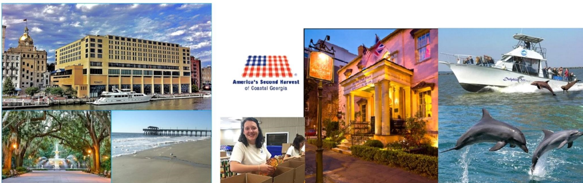
Passport To The South

Plan to arrive in time to join our Community Service Activity at America's Second Harvest of Coastal Georgia; sign up for exciting Guest and Children/Teen Activities!