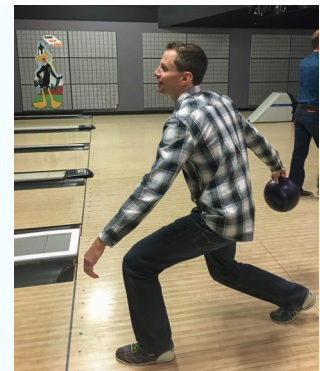
BOWLING NIGHT NOVEMBER 16, 2016 Our annual RUSH event.